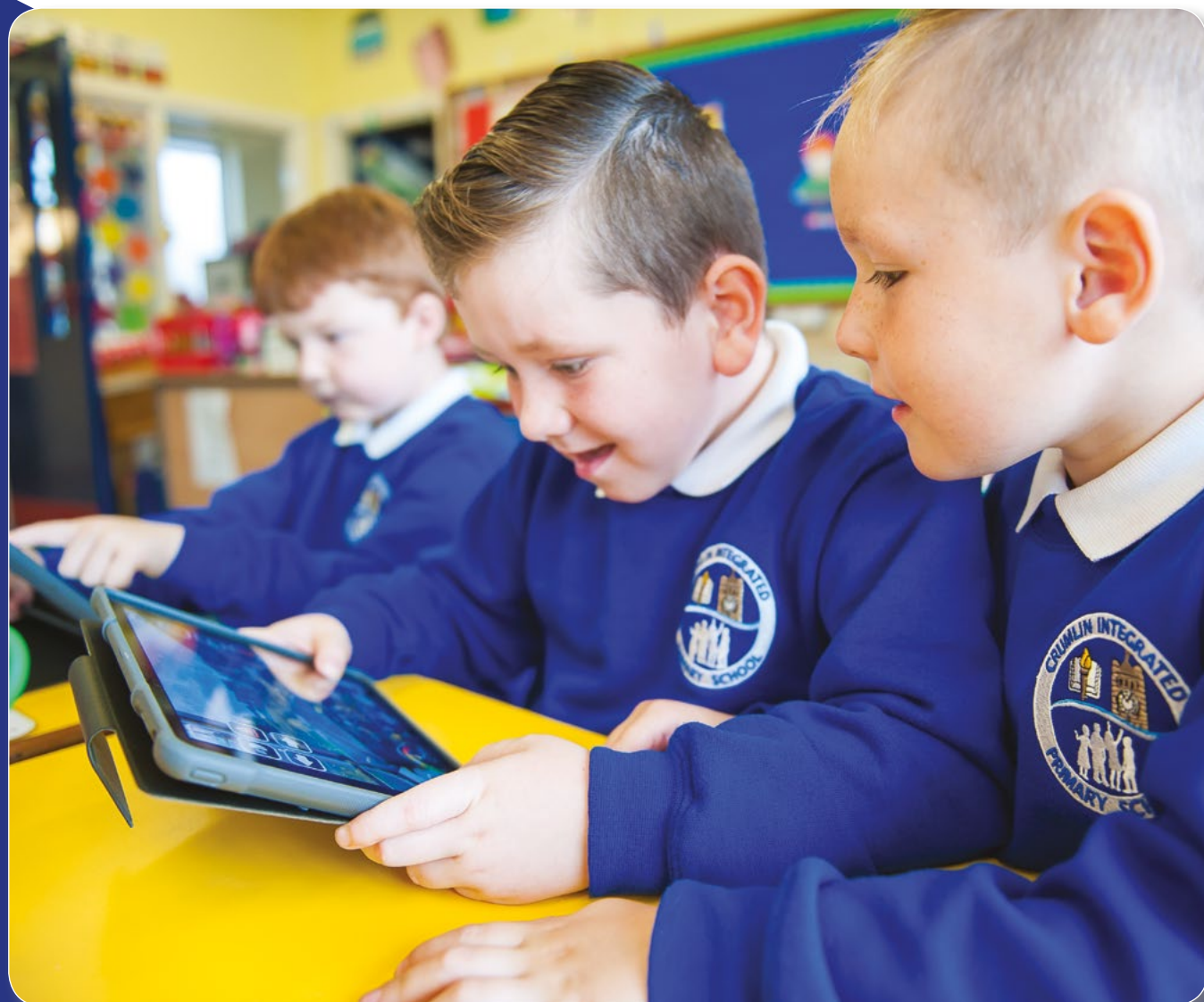
Photography & Design by www.coolforschoolcreative.com

We are constantly reviewing and evaluating our policy, procedures and practices and welcome constructive feedback.